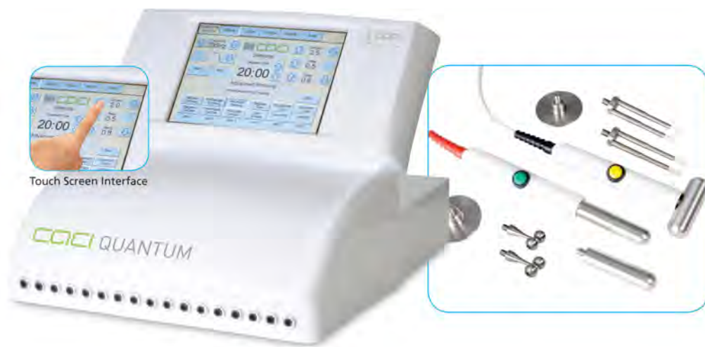
Touch Screen Interface